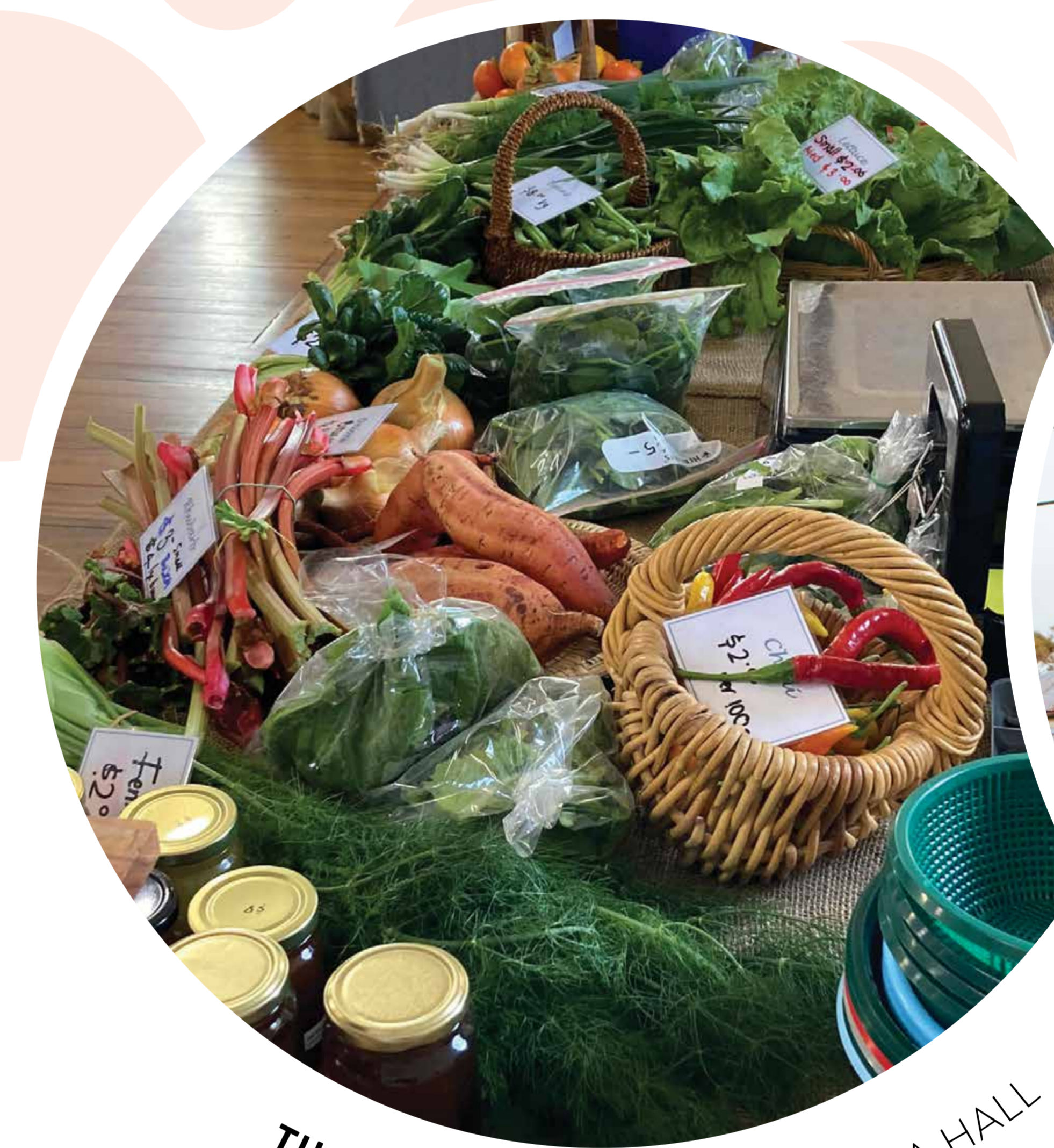
TILBA MARKETS, CENTRAL TILBA HALL

Today the two general stores have become one and incorporate the post office - they are not lost. The community halls continue to be lovingly restored as a central focus to the district's life. The Saturday Market provides local produce and a meeting place.