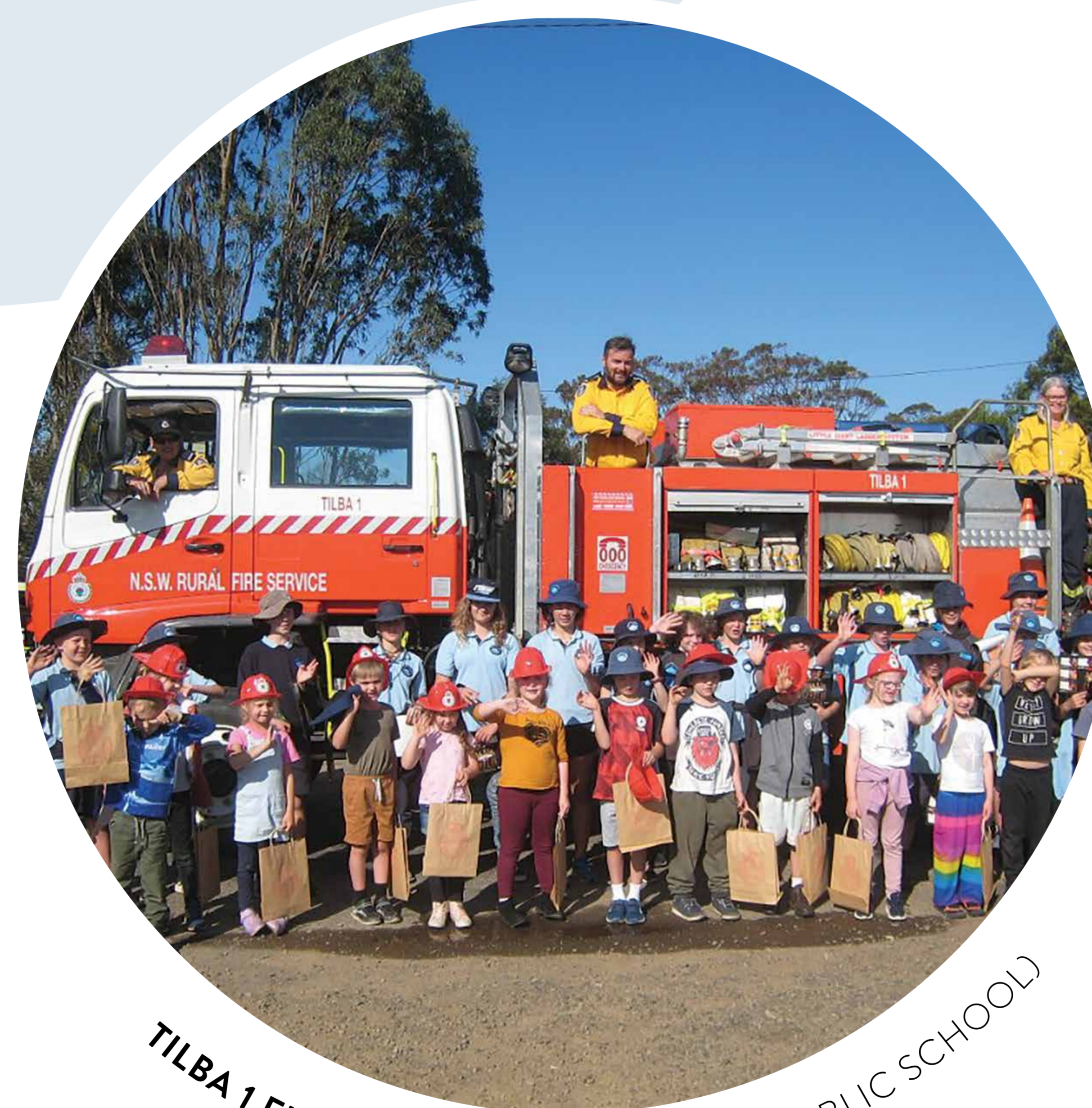
TILBA 1 FIRE TRUCK (CENTRAL TILBA PUBLIC SCHOOL)

That same year the villages of Central Tilba and Tilba Tilba were recognised by the National Trust as being of historic value, having a unique relationship with the surrounding landscape.