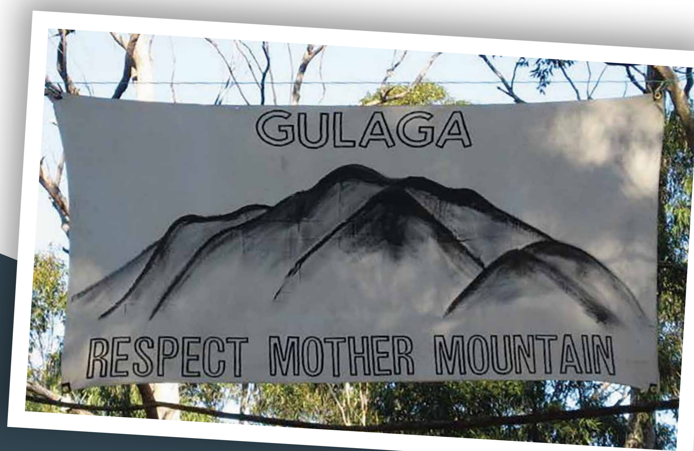
LOGGING PROTESTS 2005

With the arrival of new families, ancient and contemporary cultural visions emerged. Aboriginal land rights were recognised in 1983, the Umbarra Cultural Centre was opened in 1995, and in 2006 Gulaga National Park containing Gulaga Mountain, 'the heartbeat of the Yuin nation' was 'handed back' to the Yuin people. 'I know their spirits are here with us.' 3