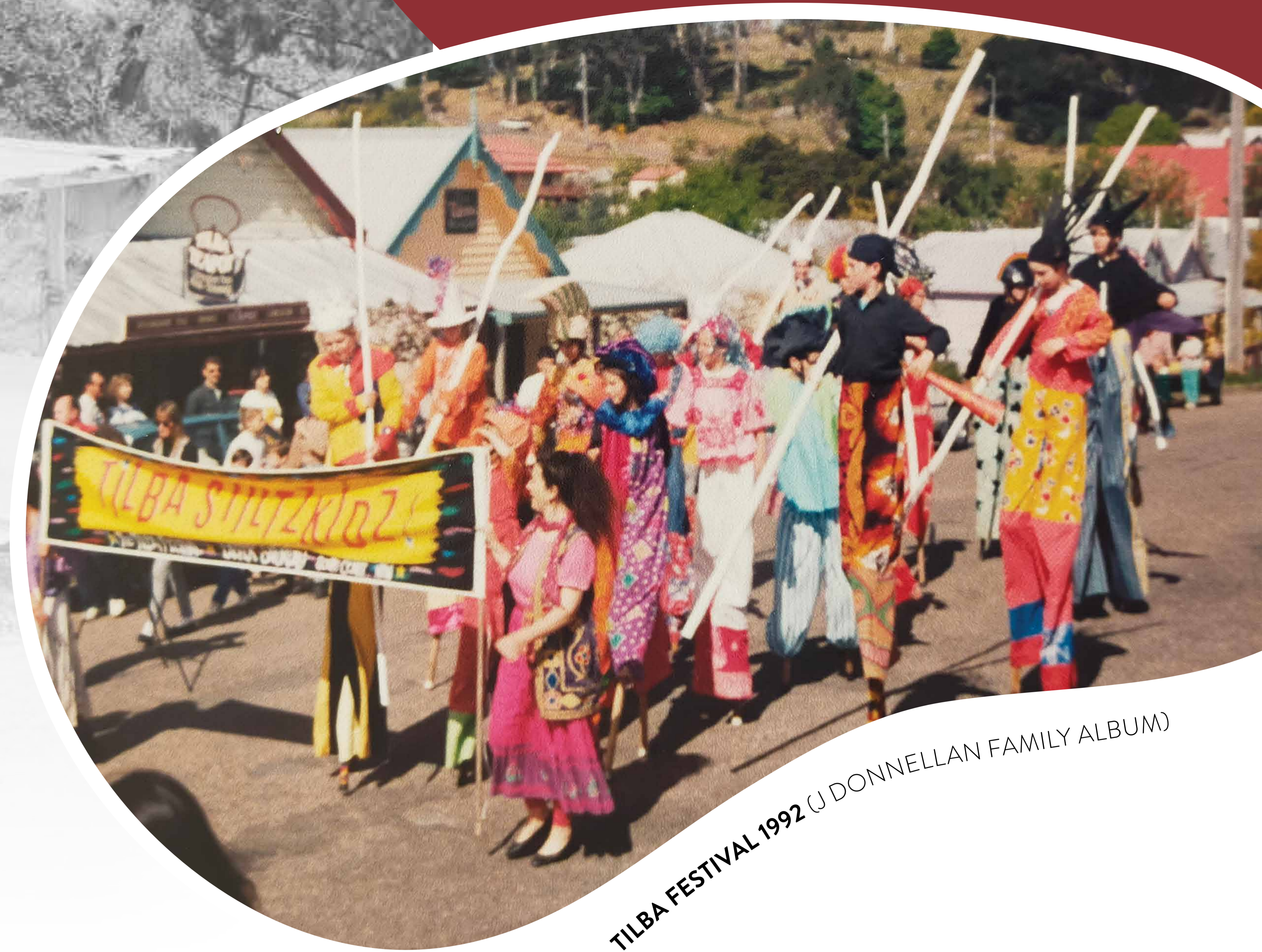
TILBA FESTIVAL 1992

The modern history and culture of the Tilba district is a response to this crisis. The Central Tilba Progress Association reformed and a small rural community, nestled by an ancient mountain, gradually became a national treasure.