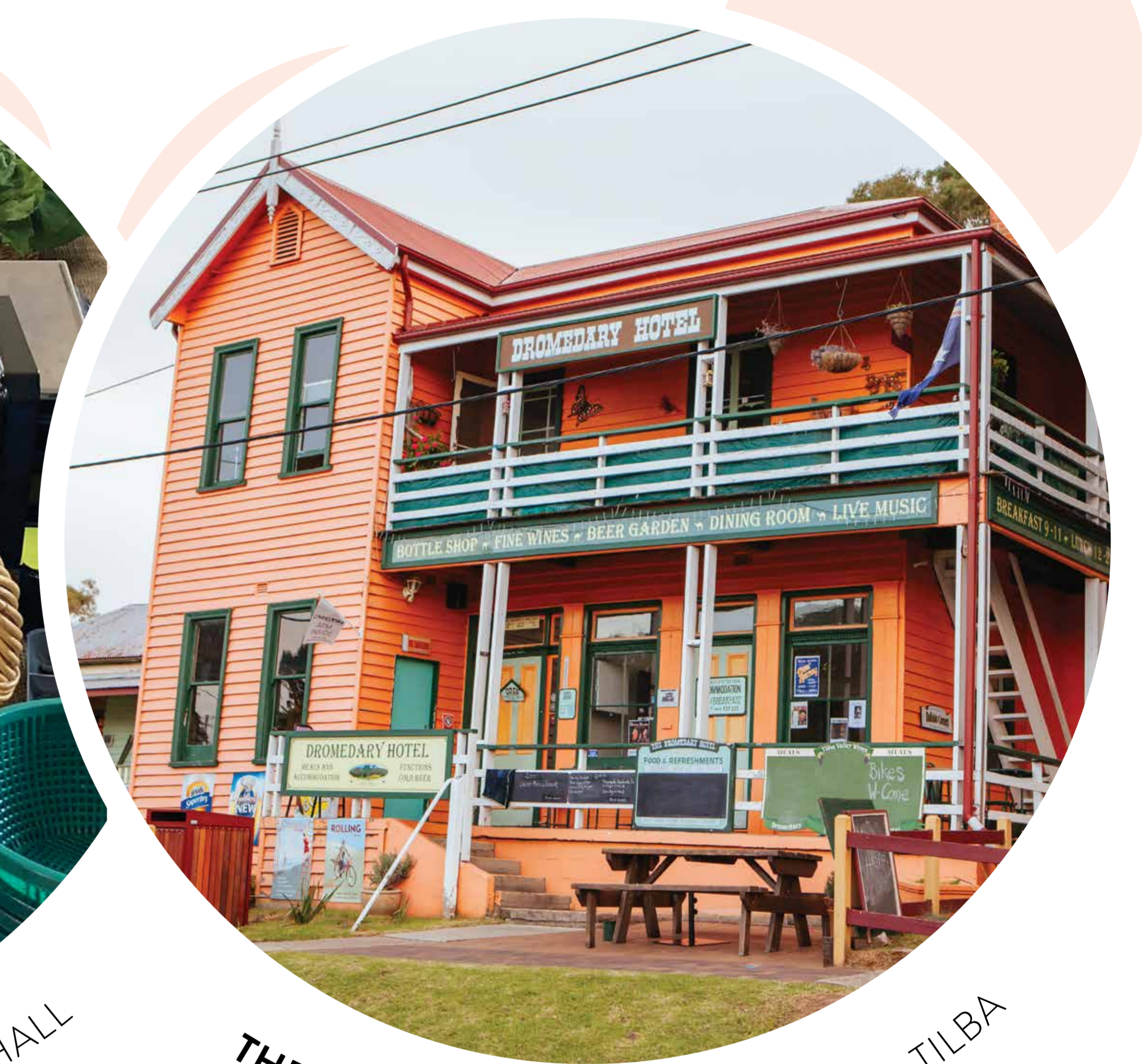
THE DROMEDARY HOTEL, CENTRAL TILBA