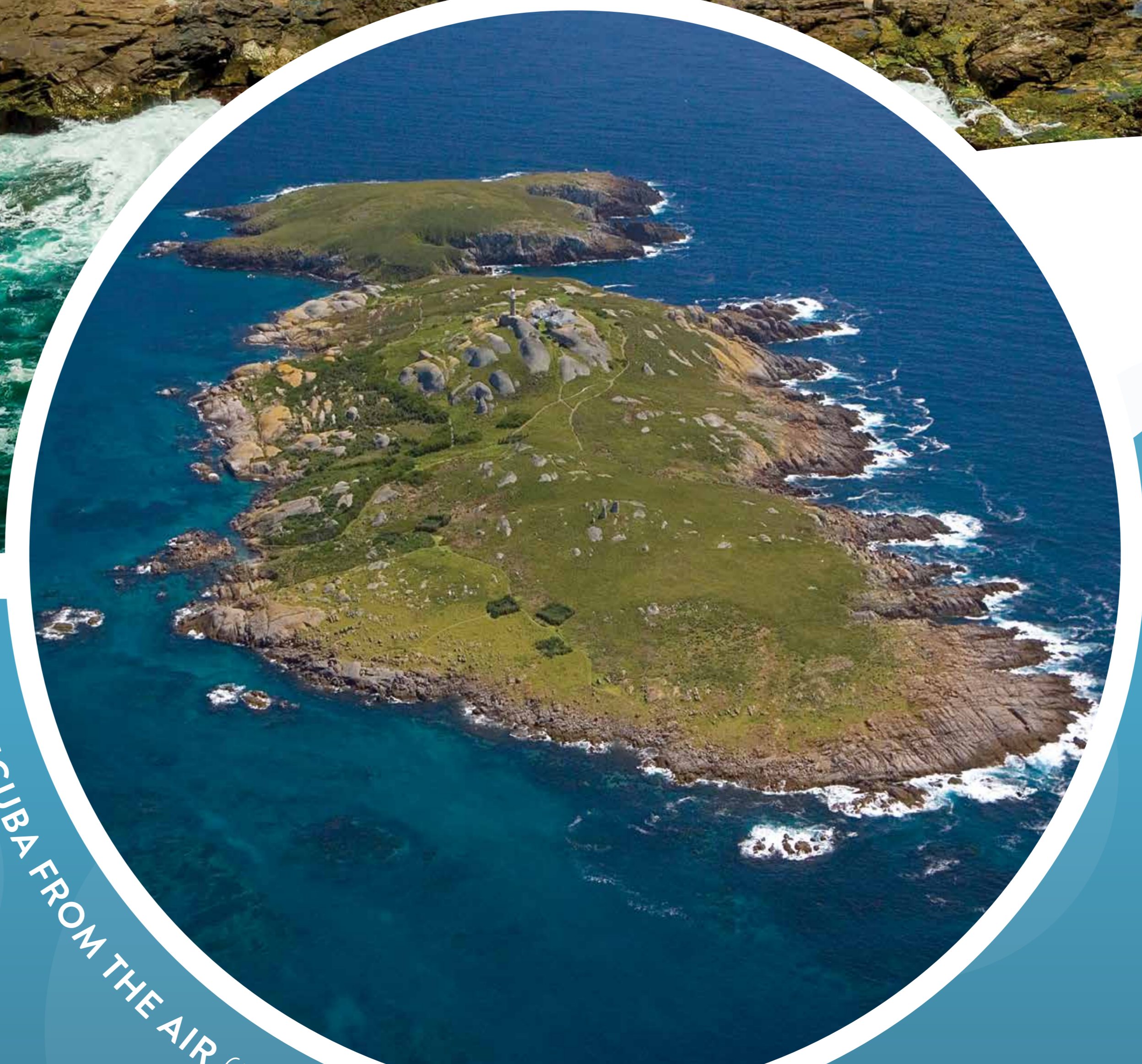
BARUNGUBA FROM THE AIR (EUROBODALLA COAST TOURISM)