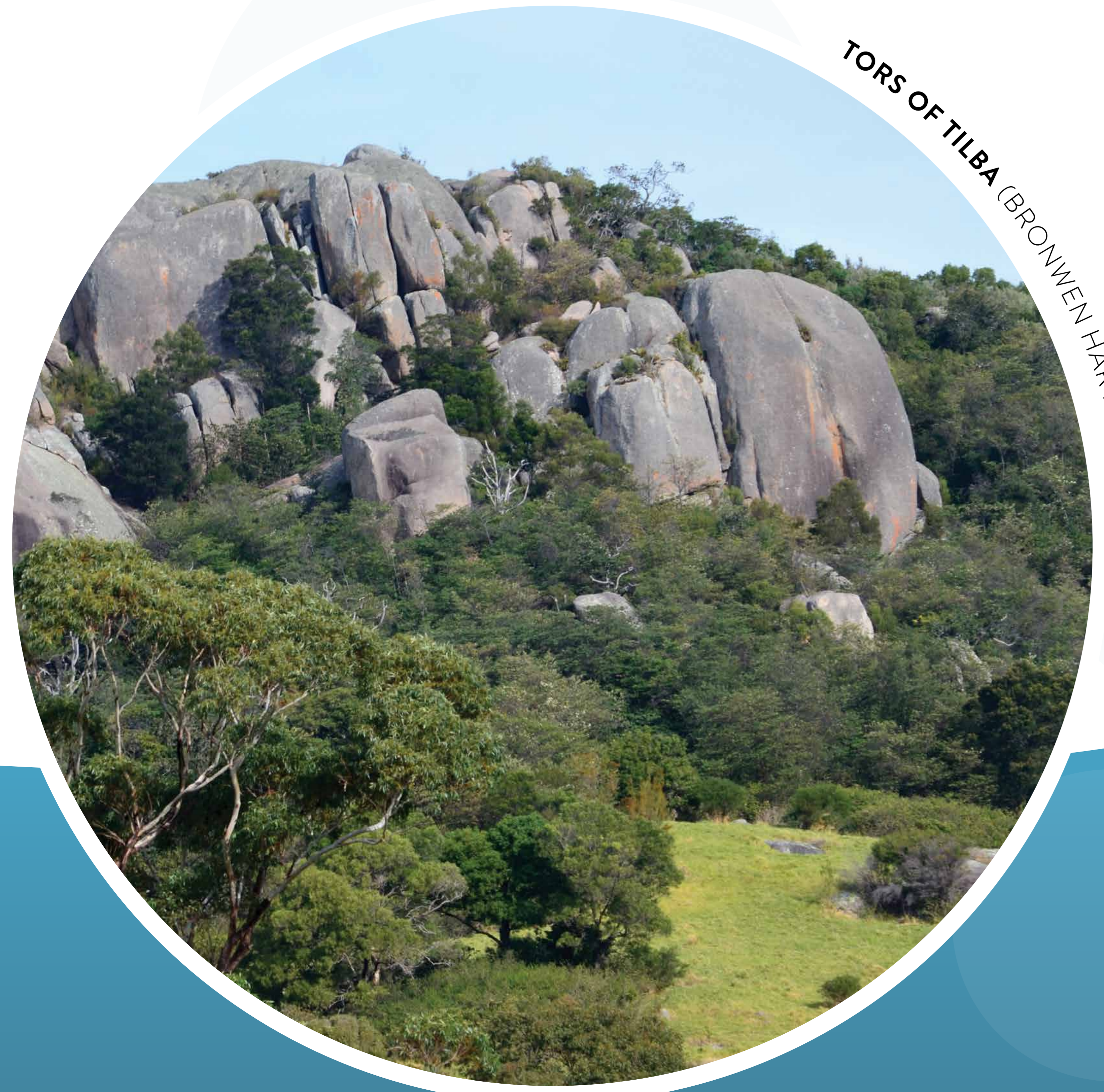
TORS OF TILBA (BRONWEN HARVEY)