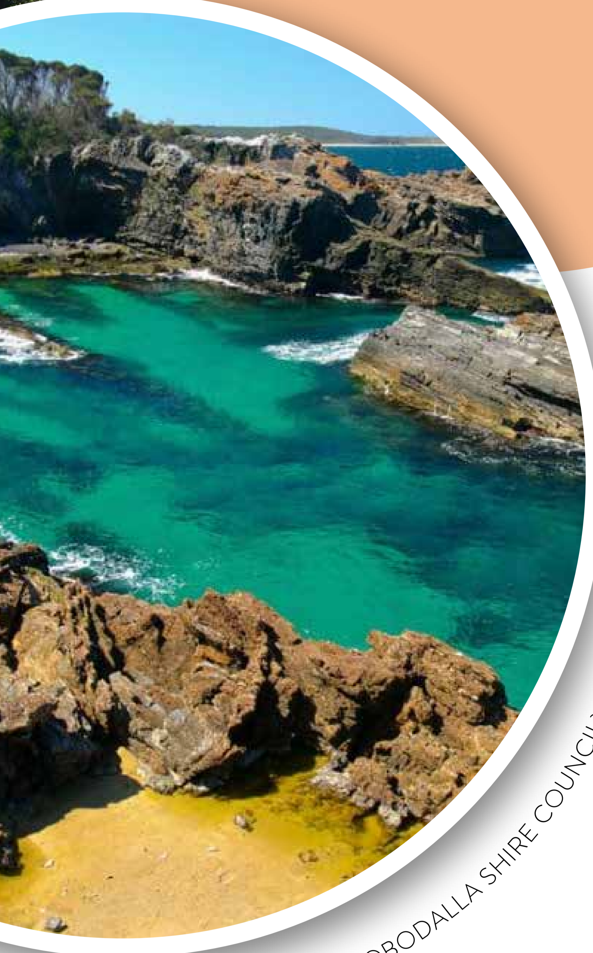
MYSTERY BAY KINK ZONE (EUROBODALLA SHIRE COUNCIL)