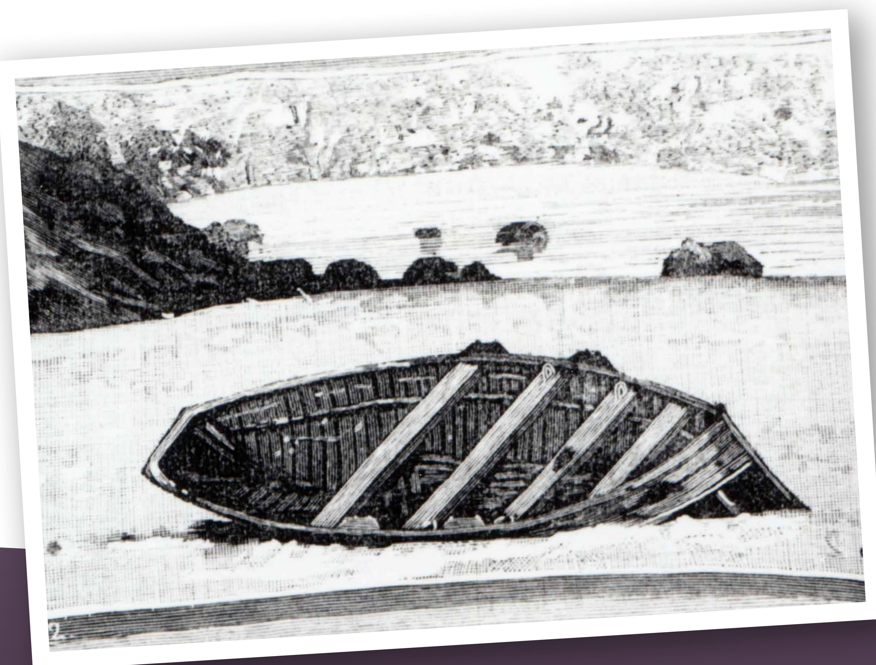
SKETCH "ON THE BEACH, NEAR THE MOUTH (BLOCKED UP BY SAND) OF THE CORUNNA LAKE" (TOWN AND COUNTRY JOURNAL, 21 APRIL 1883)