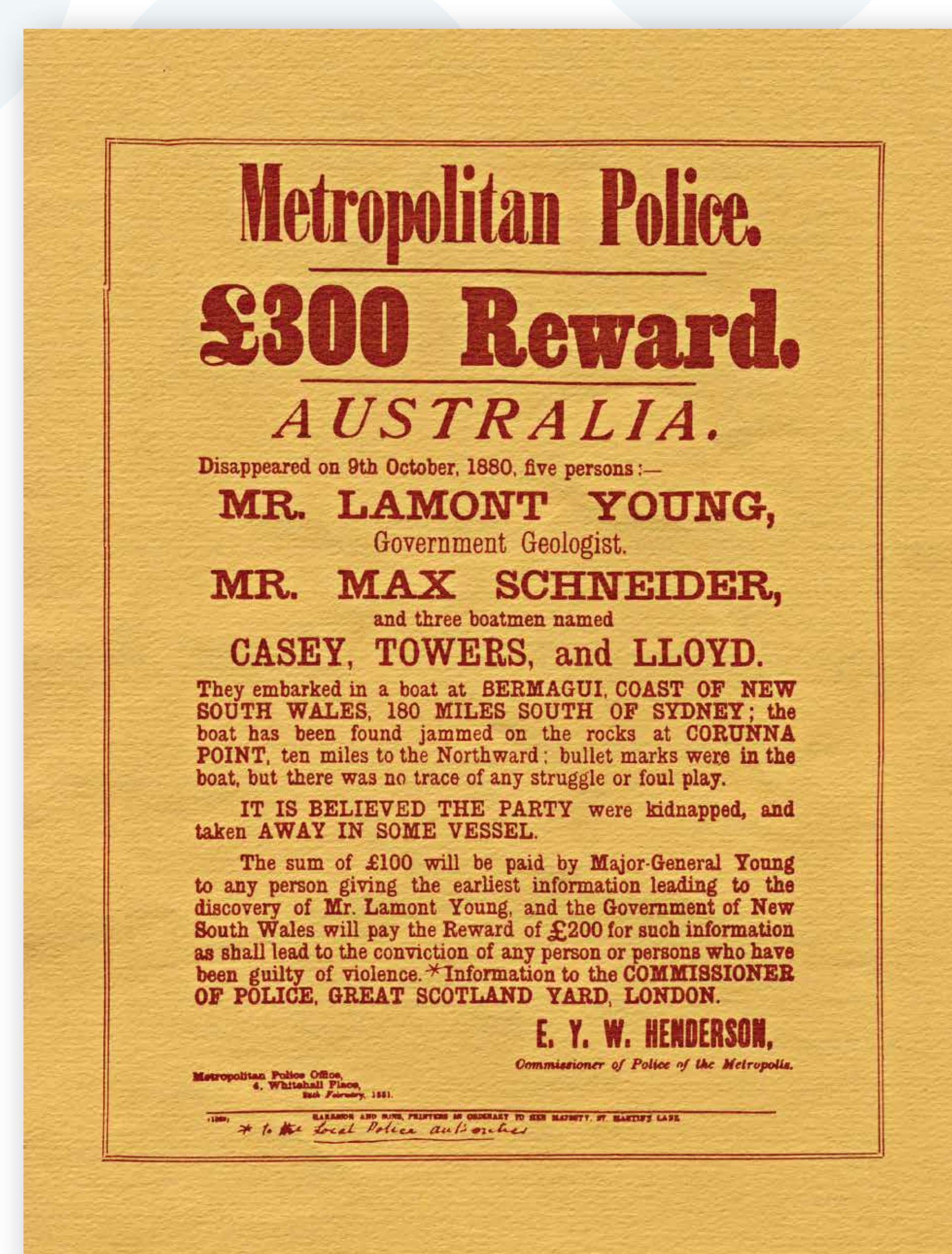
REWARD NOTICE (NSW STATE RECORDS 4/459 AND 4/460)

To this day there is no credible explanation for the disappearance of the five men.