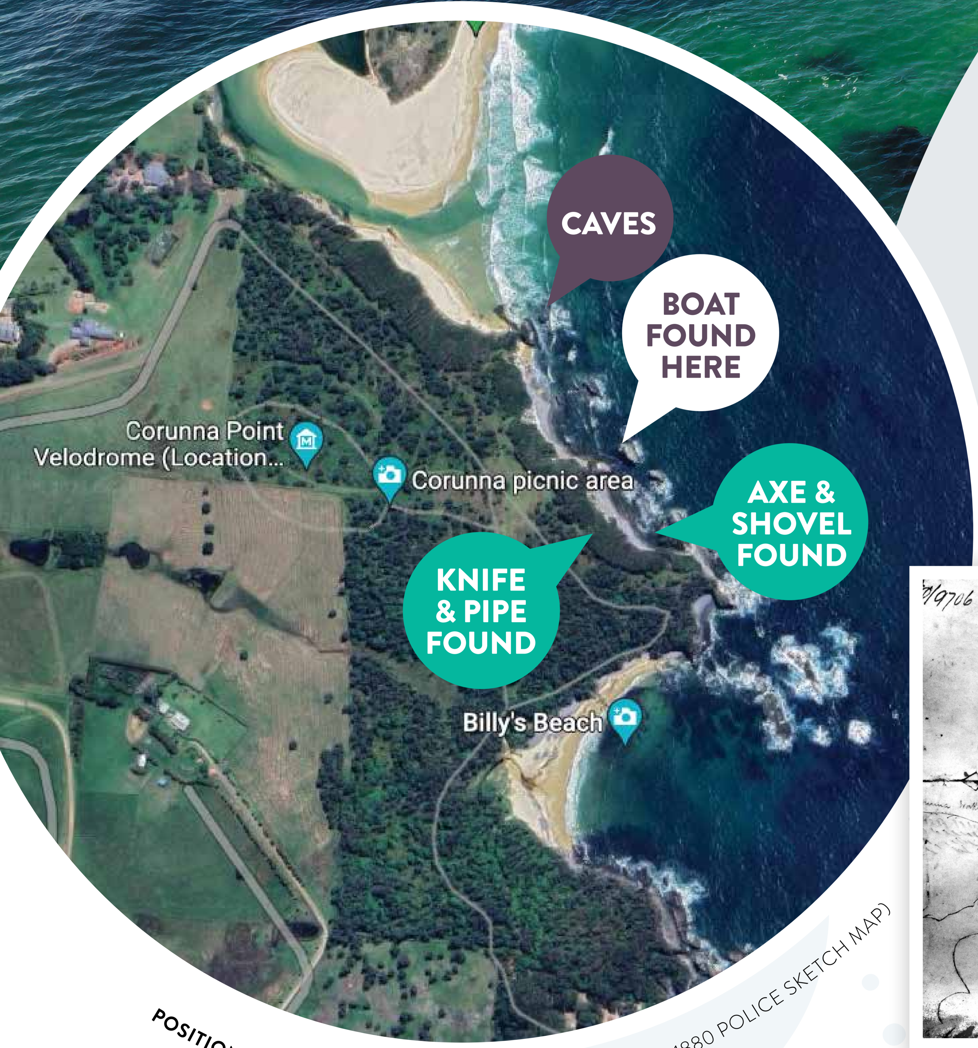
POSITIONS OF EVIDENCE, CORUNNA (ACCORDING TO 1880 POLICE SKETCH MAP)

None of the five men were seen again after Saturday.